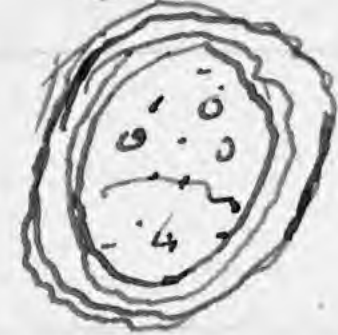
They're Pollen before the escape from the Pollen Sac

Taxodium has two erect ovaries like Thuja . [ Dr. Prad. has the same also Beeth & Hook Sachs p. 452 Engl. J. In Abietinae the well known Cones are the female flowers (or rather fruits ) - the whorled scales appear as axillary structures in the axils of bracts which spring from the axis of the cone. The semi-coniferous scale arises at first as a protuberance of the base of the bract , and is therefore not axillary - the semi-coniferous scale must therefore be considered as a greatly developed